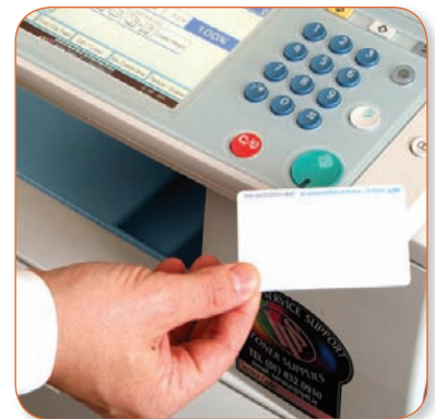
Smart Copying / Printing