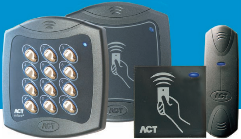
ACTpro MIFARE Reader Range

The memory on the MIFARE® classic is divided into 16 sectors and each sector is protected by its own keys. A MIFARE® Classic card can store data on each sector. Each MIFARE® Classic card has a unique serial number.