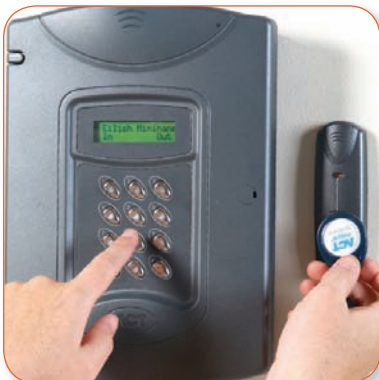
Time & Attendance