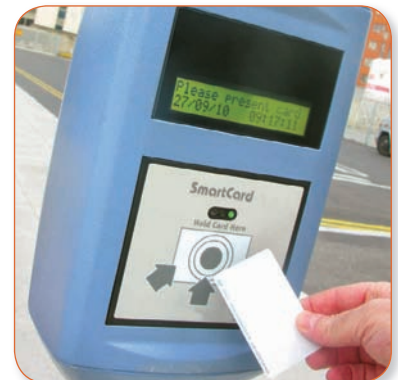
Travel & Transport